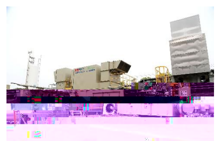
Hydrogen Power Generation Plant