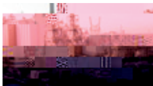
Energy/Environmental Preservation Facilities