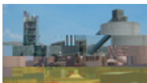
Industrial Plants and Equipment