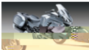
Motorcycles, Personal Watercraft