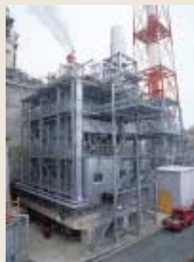
Low NO x heavy oil burning boiler ( ) ( )