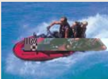
Introduction of returnable packing materials for Jet Ski engines