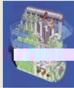
Electronically controlled marine diesel engine