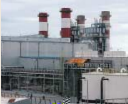
Combined cycle power plant ( )