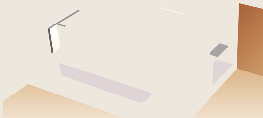
NO 2 removal system for road tunnel