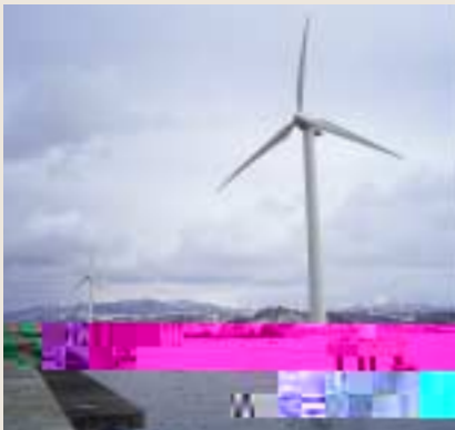
Wind Turbine Generation System